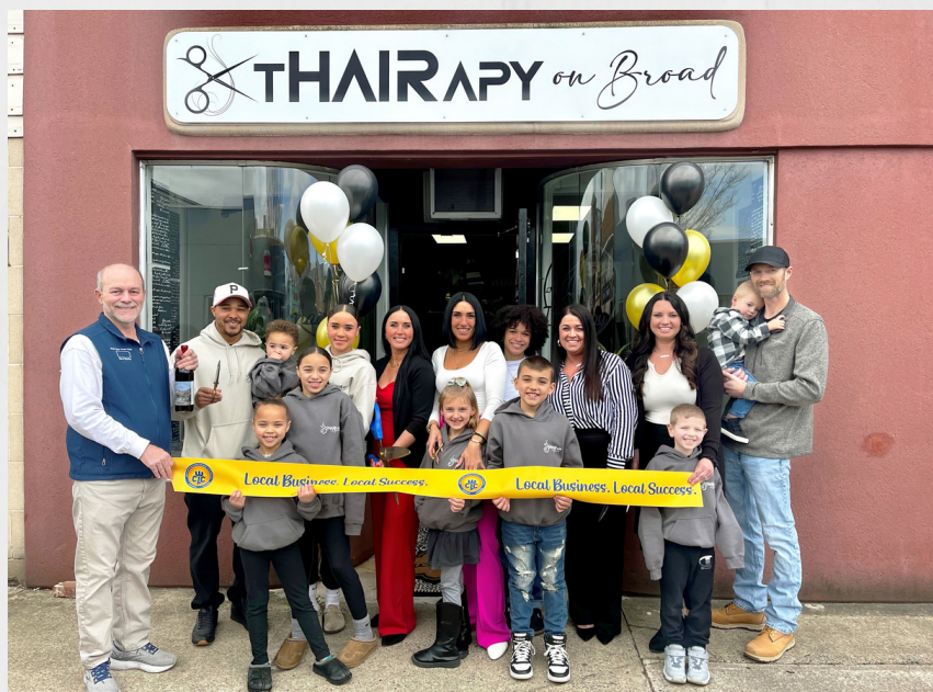
The team at Thairapy on Broad held their Grand Opening and Ribbon Cutting on Saturday, March 22nd. Go and check out their location at 346 Broad Street in Montoursville.