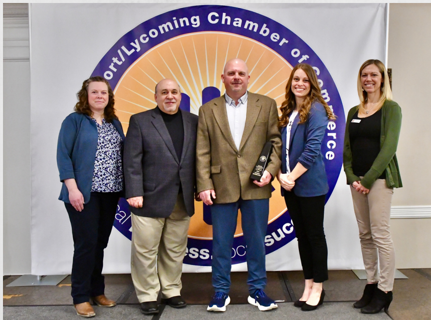
2024 Phillips/Plankenhorn Small Business of the Year Award Natural Waterscapes