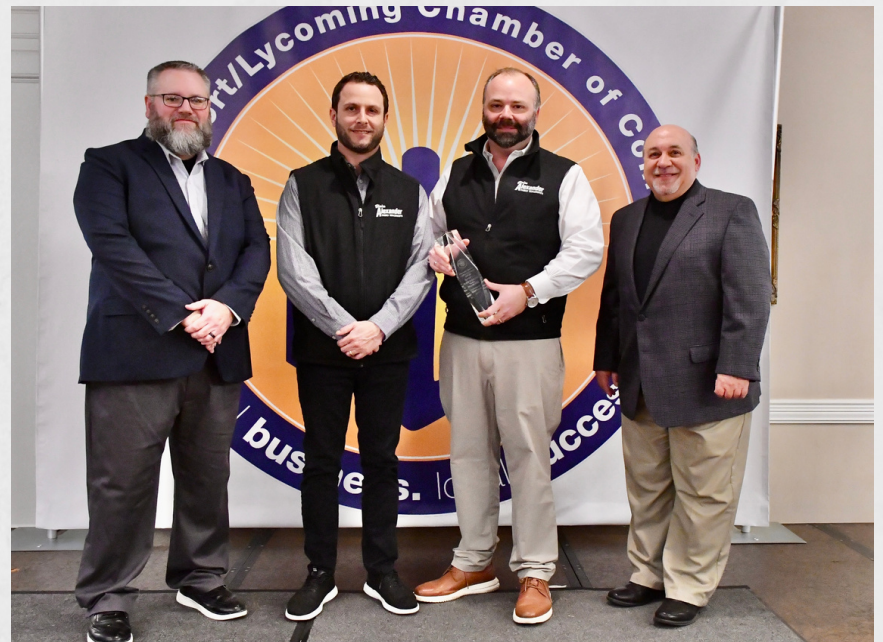
2024 Staiman Family Large Business of the Year Award Blaise Alexander Family Dealerships