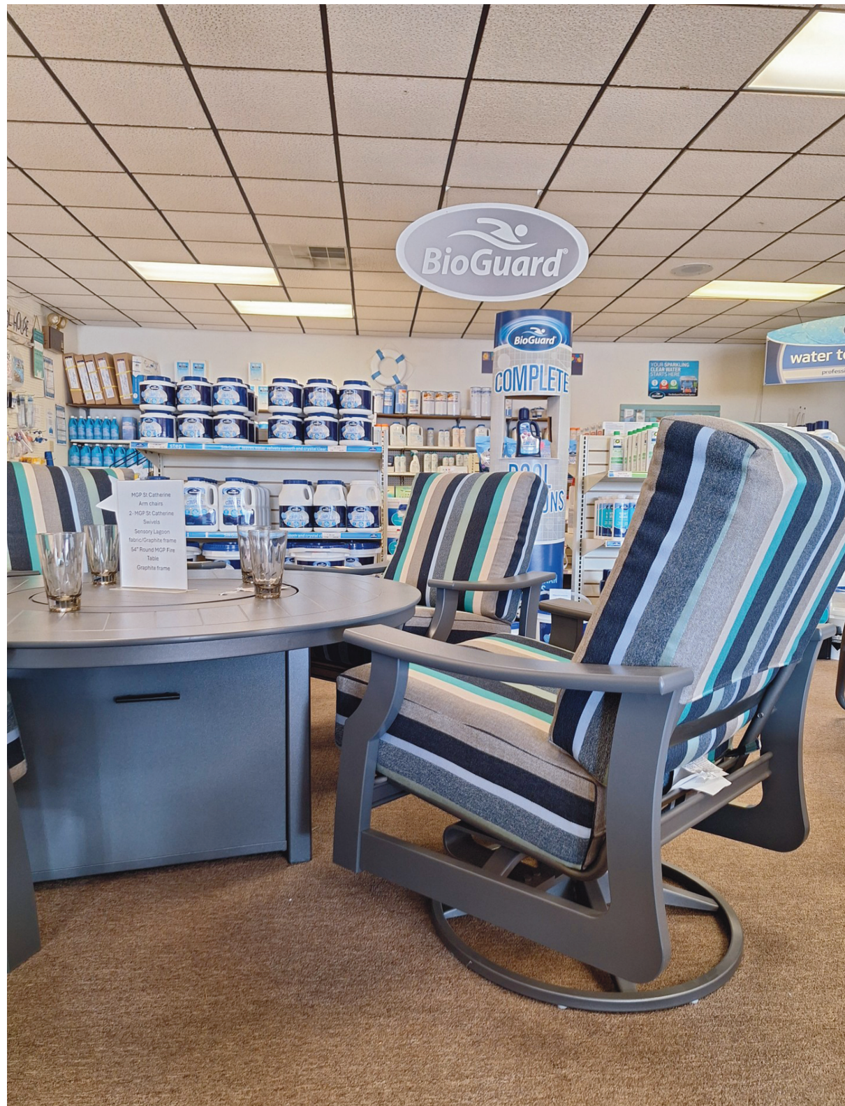
Chairs and pool accessories are on display at Aquarius Pool and Spa, which soon will relocate to 960 Plaza Drive, Montoursville.

Aquarius Pool and Patio guarantees its customers - new and loyal - a perfect blend of forward thinking, next generation innovations coupled with decades of industry leading experience.