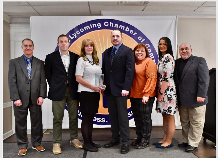
2024 Emerging Business of the Year Award The Potting Bench