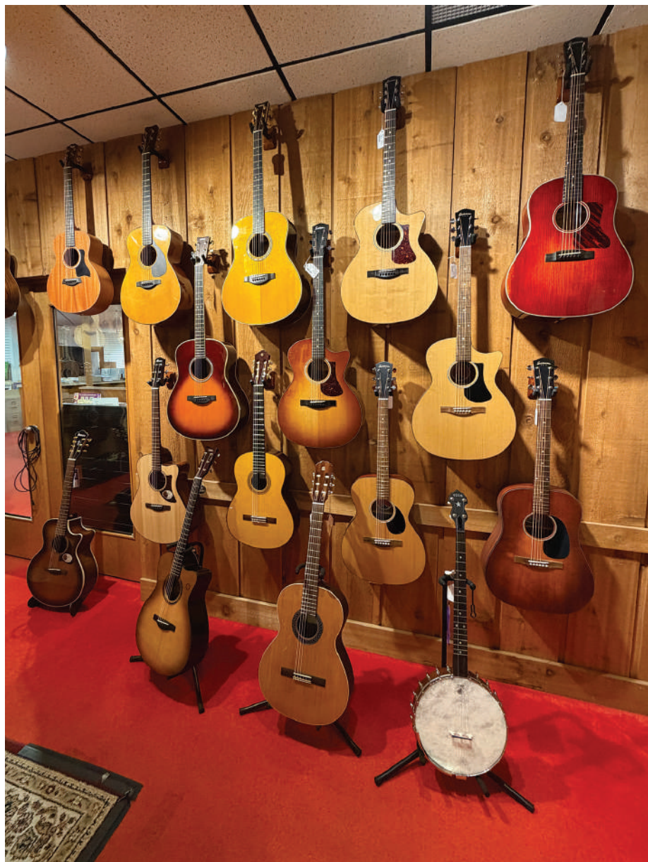
Guitars line the wall at Robert M. Sides Family Music Center.

“What we include in that tour is some of the more interesting things, because the building we’re in is a three story structure that was a textile mill built in 1904, and the one street on the side of the store is called Canal Street because that was literally one of the canals that fed into the river,” Sides explained, adding that the building still dis-