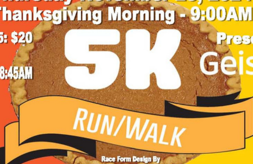
Race Form Design By El Dobeler-Wyland, WAHS Student