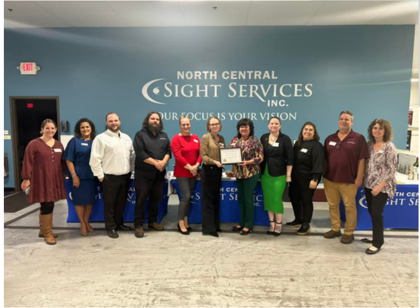
North Central Sight Services held a PM Exchange on October 24th at their location on Reach Road. Attendees were given tours of the facility and were able to have a hands-on opportunity to learn about services offered at the facility.