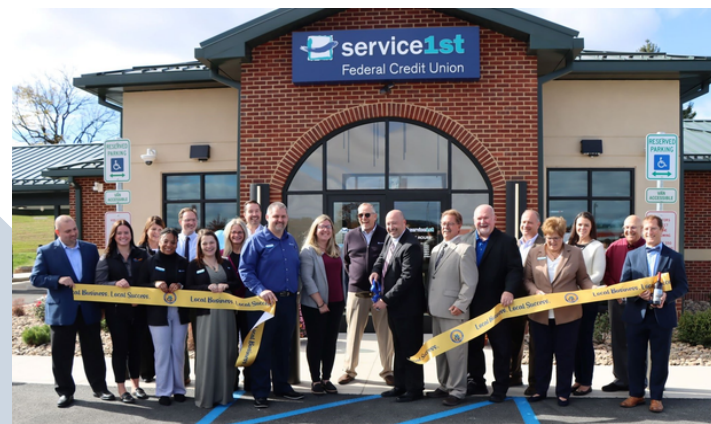
Service 1st Federal Credit Union cut the ribbon on their brand new branch office in Muncy. Head over to check out some of their state-of-the-art technology at 200 Muncy Creek Boulevard.