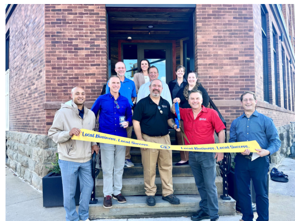
Jackass Brewing Company officially opened their doors on October 4. Head to their Williamsport location at 301 West Third Street to enjoy great food and drinks.