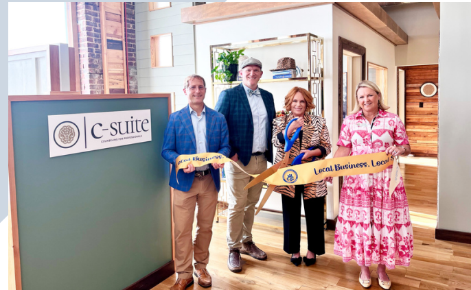
C-Suite held a Ribbon Cutting on October 3 to celebrate their opening. They are located at 153 West Fourth Street, Suite 5 in Williamsport.