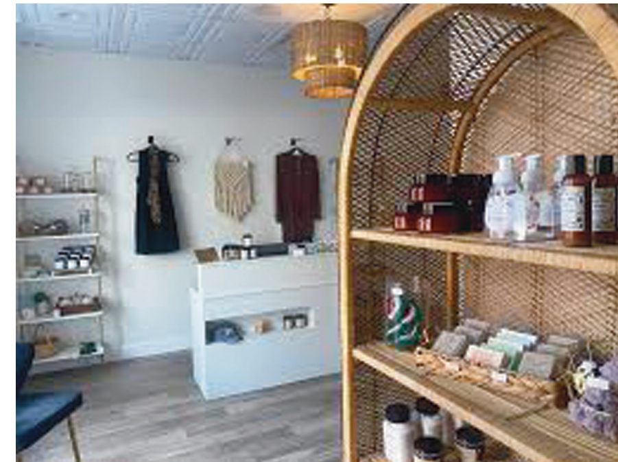
The interior, left, and exterior, right, of Bec's Beauty Company, a salon on Market Street near the intersection with Fourth Street.

"In this industry, a lot of times, the money that you're making, half of it goes to your employer, so that was one thing where I just felt like I was working a ton and not seeing all of the benefits, which is one of the reasons I also wanted to open a place that I could have employees work for me and they still make a good chunk of money," she explained.