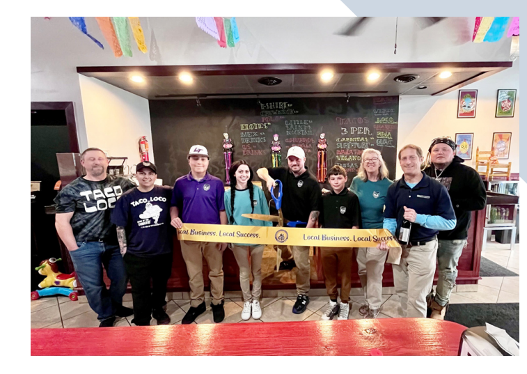
Taco Loco cut the ribbon on their space at 11 West 4th Street in Williamsport. Head over for some delicious tacos!