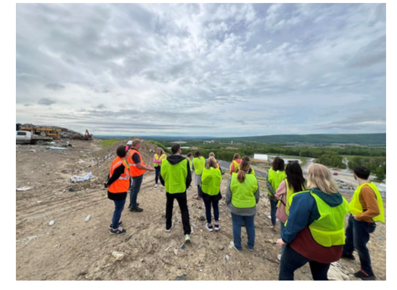
Leadership Class of 2024 at Lycoming County Landfill