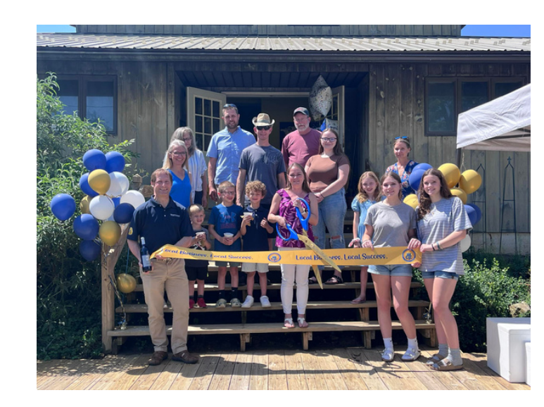
Divergent Travel in Montoursville celebrated their Ribbon Cutting on May 25th. If you have travel needs, you should head over and check them out!