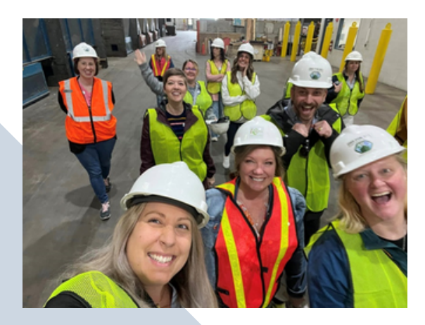
Visit to the Lycoming County Recycling Center