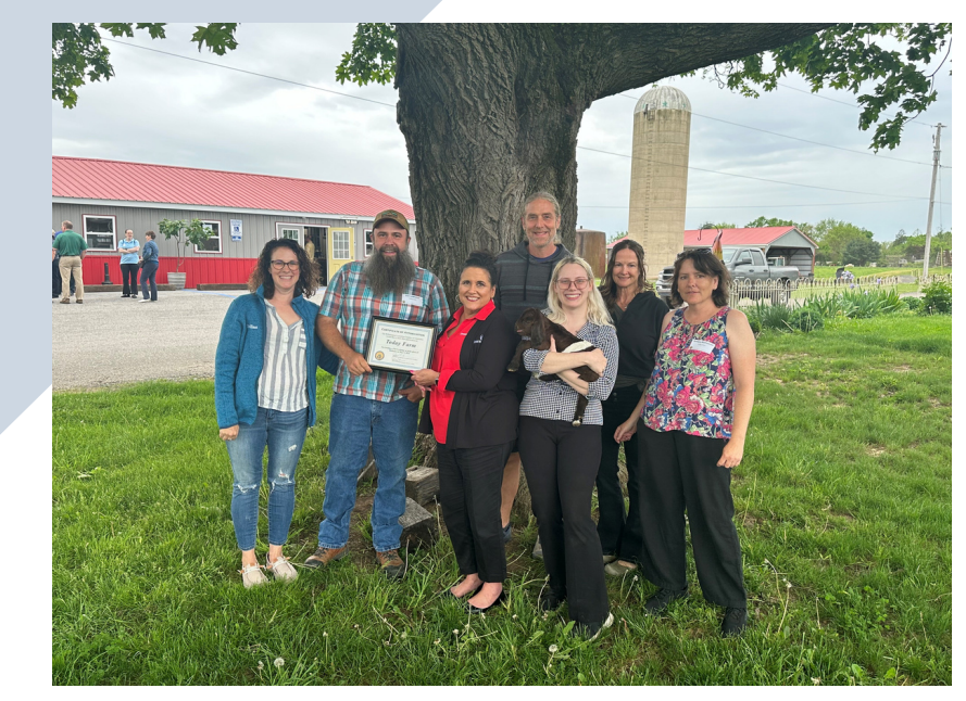
Our first PM Exchange of May was held at Today Farm in Muncy. Guests were treated to beverages by Bullfrog Brewery and delicious food from Susquehanna Mills.