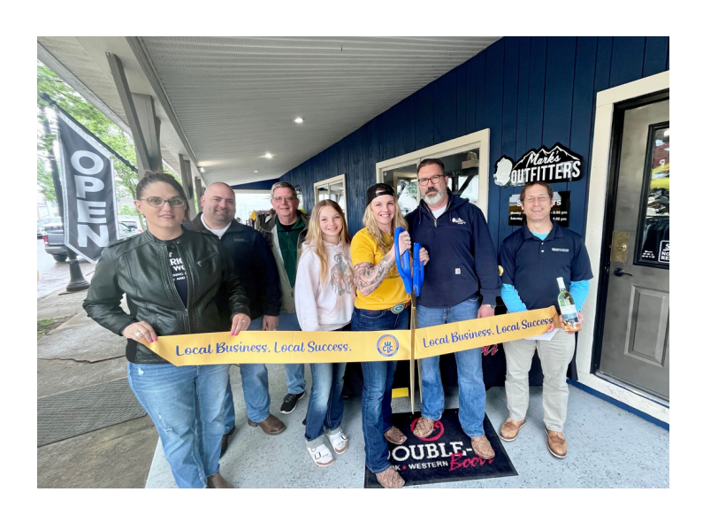
A Ribbon Cutting was held in Hughesville at Mark's Outfitters to cap off their week-long anniversary sale.