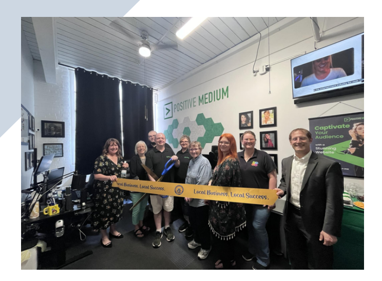
Positive Medium kicked off the month with a Ribbon Cutting to celebrate their new space on June 1.