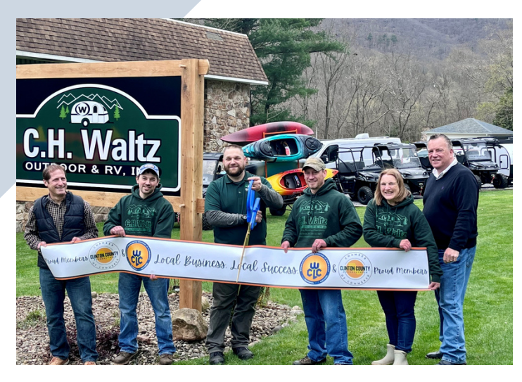
C.H. Waltz Outdoor & RV celebrated their new store with a Grand Opening and Ribbon Cutting Ceremony at their location at 5335 North Route 44 in Jersey Shore.