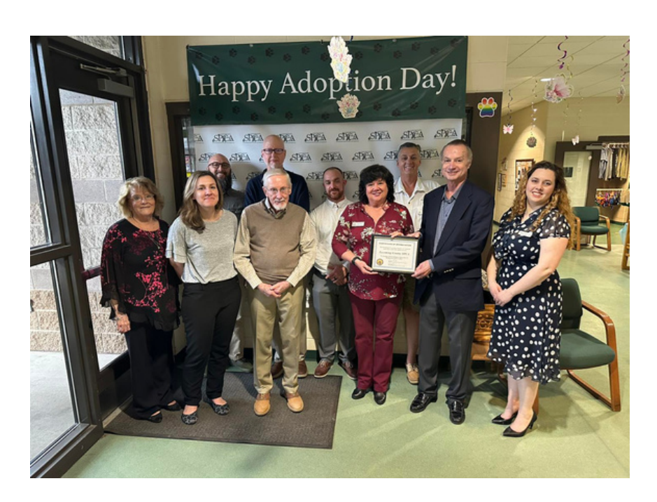
The Lycoming County SPCA held a PM Exchange on April 11. Guests were treated to tours of the facility as well as food and drinks.