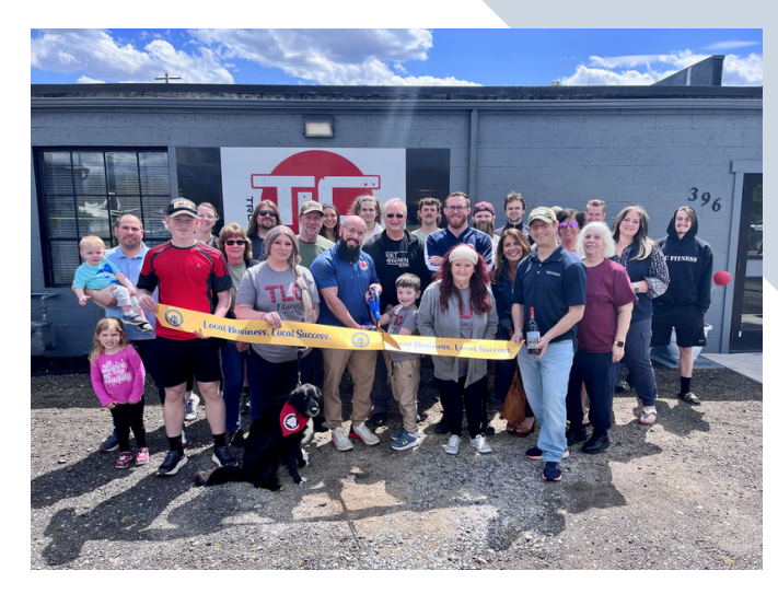
TLC Fitness moved to a new location in South Williamsport. You can check it out at 396 East 2nd Avenue.