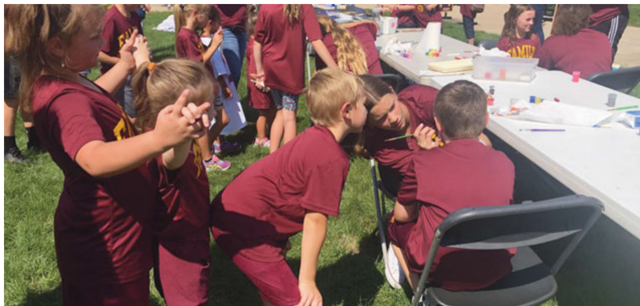
Students of St. John Neumann Regional Academy and their families participate in a walk-a-thon in September of 2022.

The overall purpose and theme of the walk-a-thon is to demonstrate how St. John Neumann Regional Academy students show and value the importance of kindness, bullying prevention, respect, responsibility, preparation and service to others