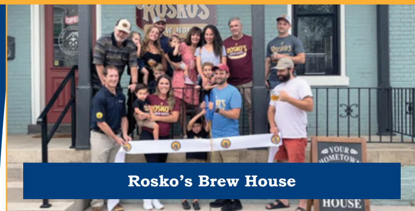
Rosko's Brew House

Rosko's Brew House celebrated their 1-Year Anniversary at 601 Pine Street, Williamsport. Set in a historic brick home built in 1870, Rosko's pairs the rich history of Williamsport with traditional, seasonal, and trendy beer styles. When you visit Rosko's, you can expect an intimate, cozy atmosphere, friendly staff, and meticulously curated craft beer. Rosko's also offers locally crafted wines, canned cocktails, and a soft pretzel that is a perfect match for its beverages. Rosko's is family friendly, and well-behaved dogs are permitted on the outdoor patio.