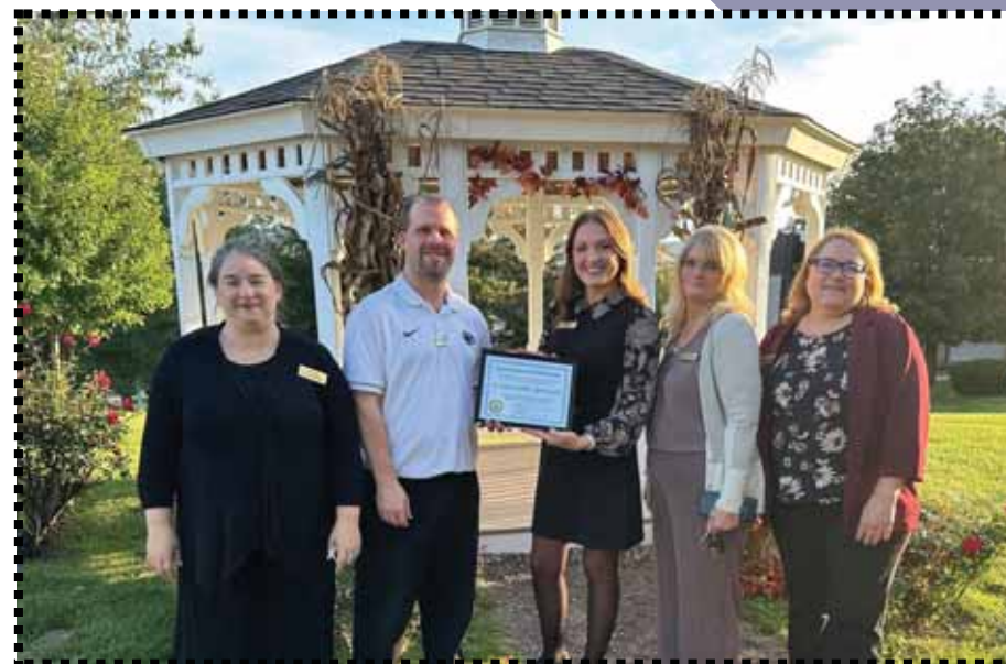
On September 21, the group from Grampian Hills Apartments hosted a PM Exchange on their gorgeous property. Chamber and community members alike came together for networking, food, drink and music.