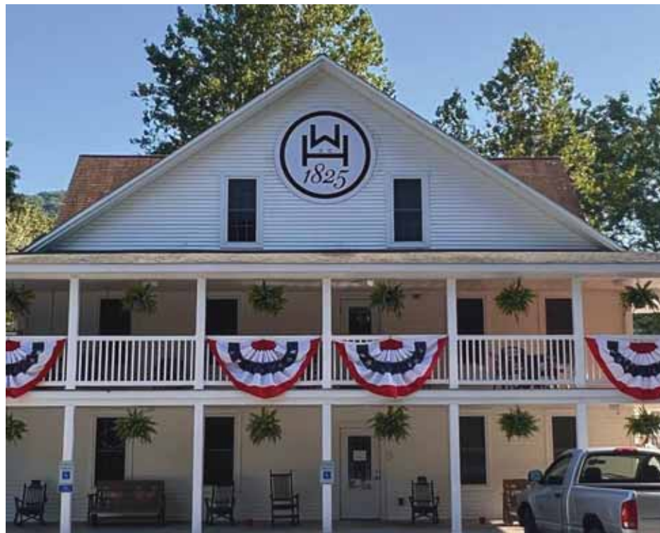
The Waterville Hotel, 10783 Route 44, offers lodging in the Pine Creek Valley.