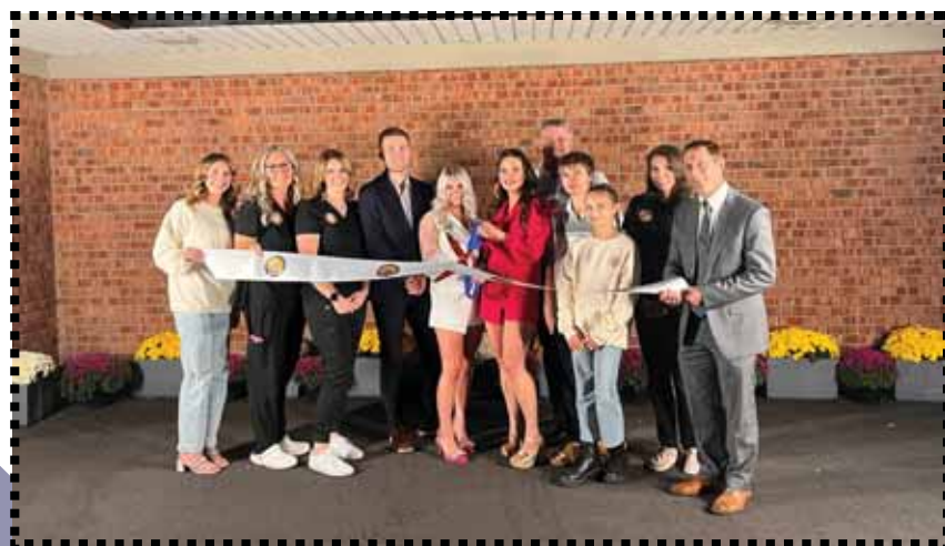
Bella Glow Med Spa showcased what they had to offer at their Ribbon Cutting and Open House. They take pride in their natural approach to medical aesthetics. Their goal is to enhance and preserve the beauty that is already there.