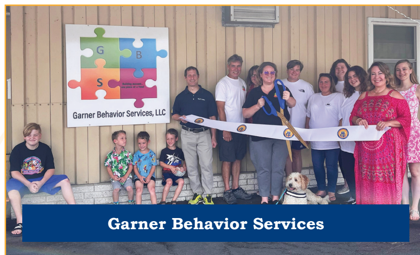
Garner Behavior Services