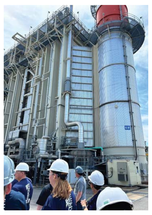
The class toured Hamilton Patriot Power Plant in Montgomery.