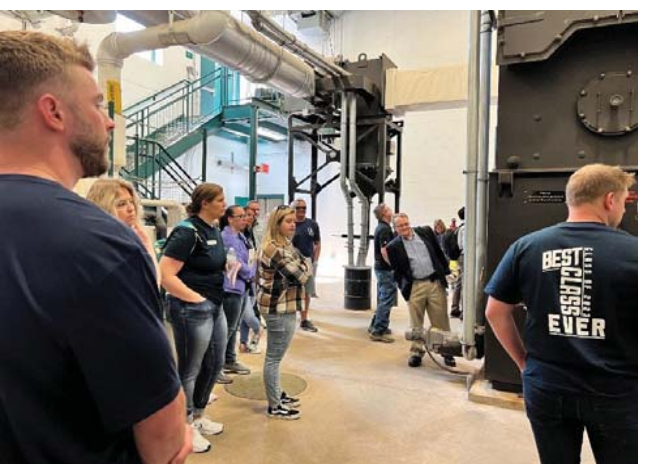
The class toured the East Lycoming School District boiler room.