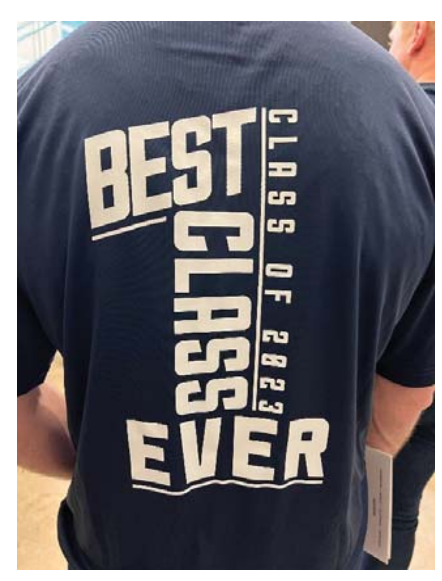
And the shirt says it all!