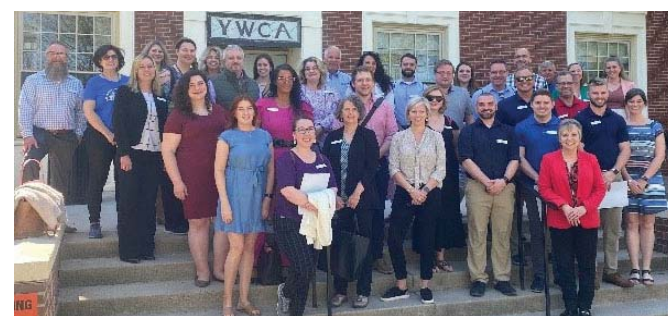
The Leadership Class of 2023 gather for a photo after touring the YWCA.