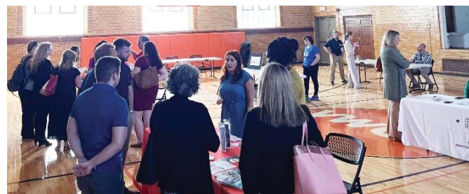
The YWCA held a Human Services Fair for the Leadership class who had the opportunity to meet with agencies in the Human Services industry.