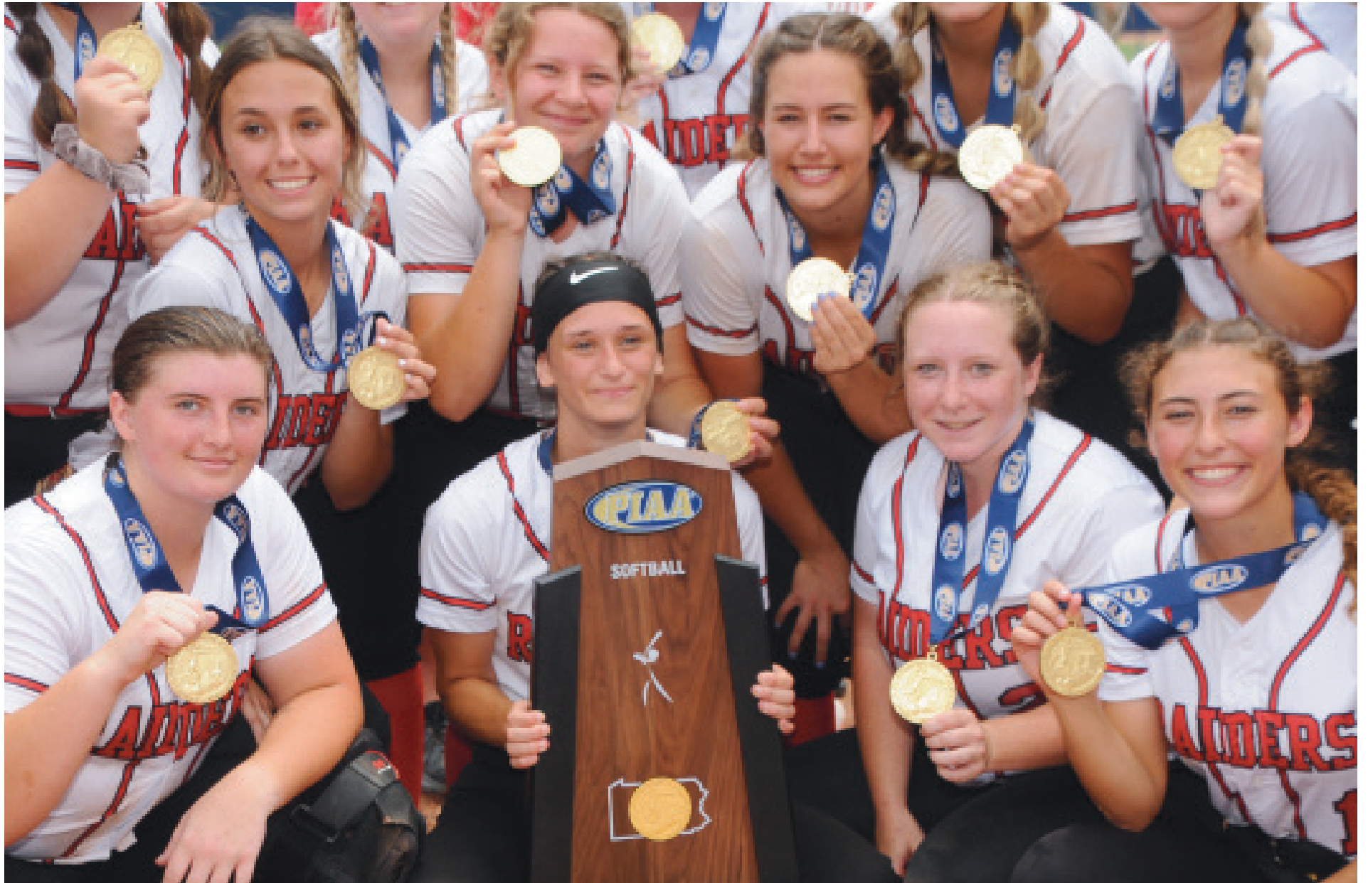
Members of the 2022 Montgomery Area High School softball team celebrate their state championship.