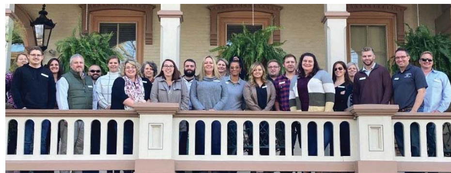
Leadership Class of 2023 stands on the balcony at the Park Home.