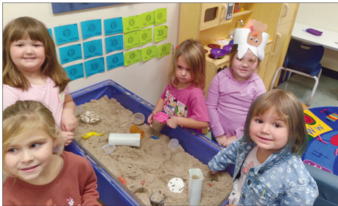
Above, a student in the Loyalsock Township Pre-K program shows off his drawing to their teacher. Left, Children enrolled in Loyalsock Township School District's Pre-K program pause from play during a morning session.