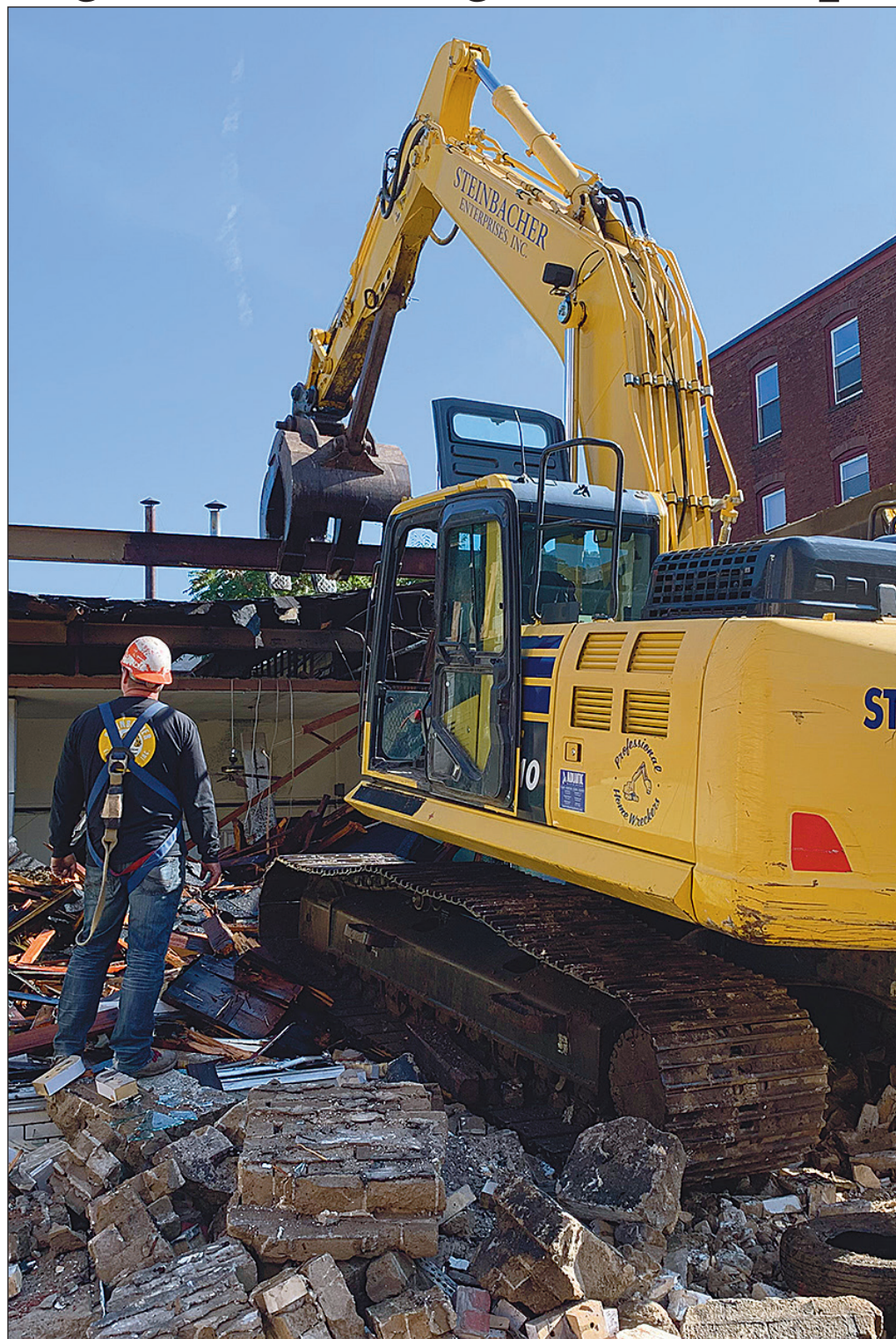
A worker with Steinbacher Enterprises oversees one of the company's demolition projects.

Steinbacher offices can be found in the Nippenose Valley at 8130 S. Route Highway 44 or their website www.steinbacherinc.com . The store, Historic House Salvage, is located at 315 Arch St., Williamsport. The website is www.historichousesalvage.com .