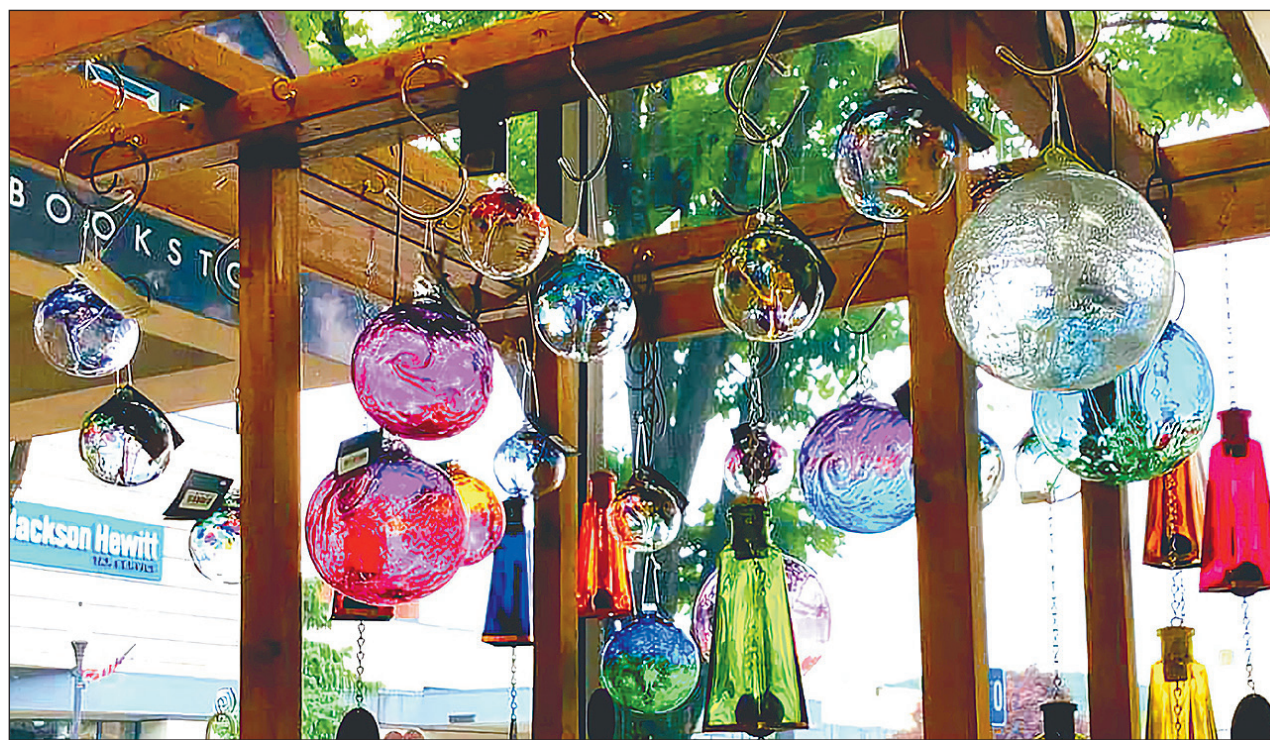
PHOTOS PROVIDED Gustonian Gifts , above, is located at 357 Pine St., in the Arts Building downtown. The store has been open since 2005 Glass ornaments, left hang in the shop.