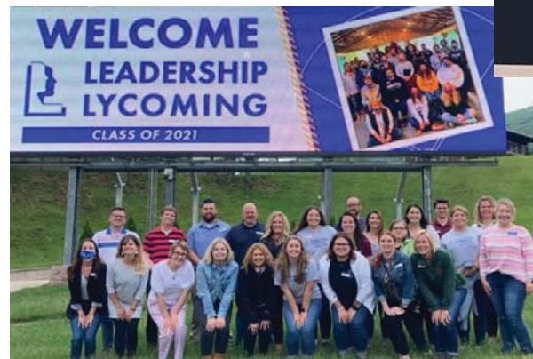
The Class of 2021 received a warm welcome from Little League during their tour of the complex.