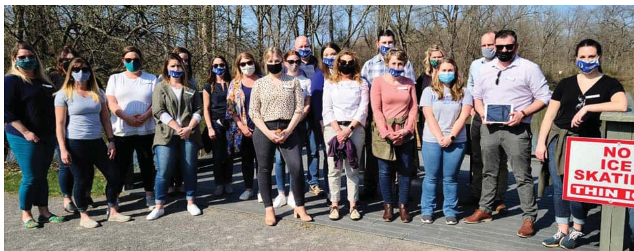
The Class of 2021 enjoyed the beautiful weather while exploring the Muncy Historical Society Heritage Park and Nature Trail.