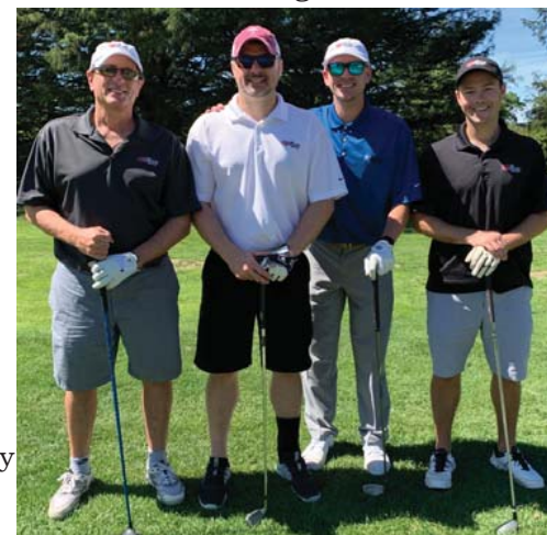
The Hartman Group staff enjoyed a fun day on the course at the 31st Annual ChamberLinks Golf Outing.