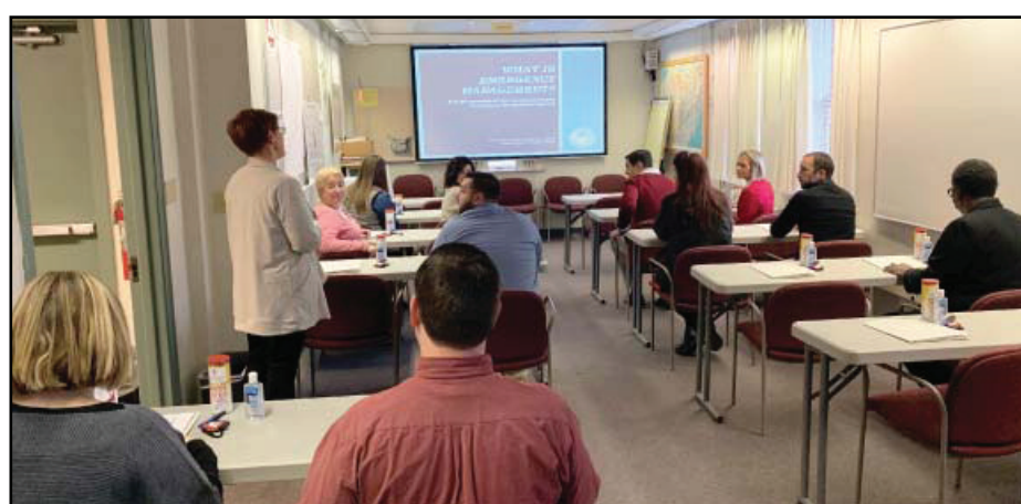
Class members toured the 9-1-1 call center and heard from members of the Lycoming County Department of Public Safety about their operations and emergency preparedness procedures.