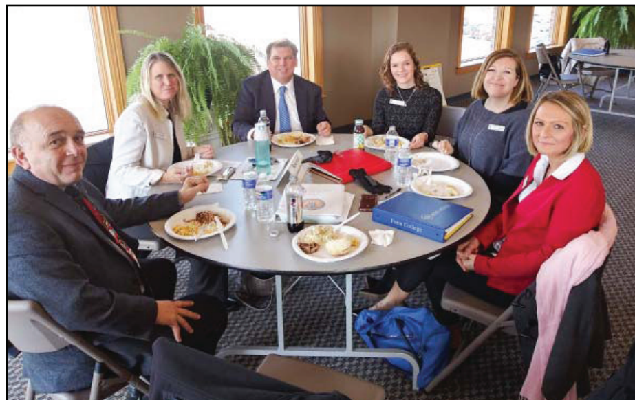
LL Class of 2020 enjoyed lunch and conversation with local elected government officials including Lycoming County Commissioner, Tony Mussare.