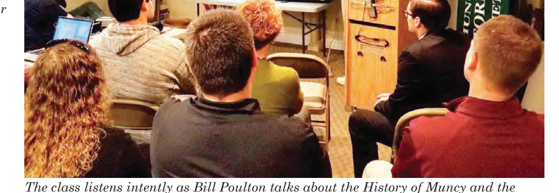
many projects they have done over the years to save the historical markers of Muncy.