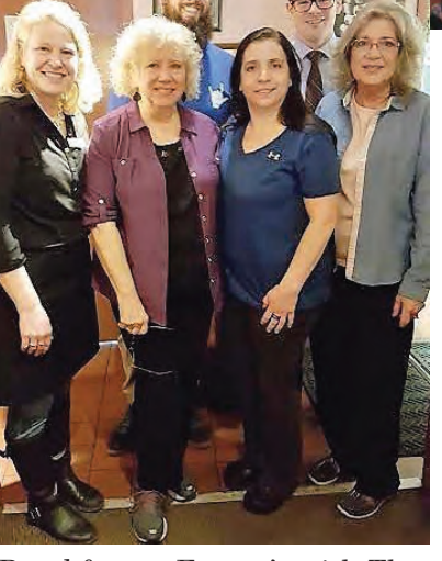
Breakfast at Franco's with The Learning Center