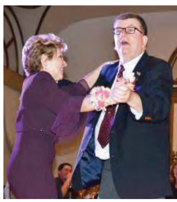
Dance The Night Away With Hope