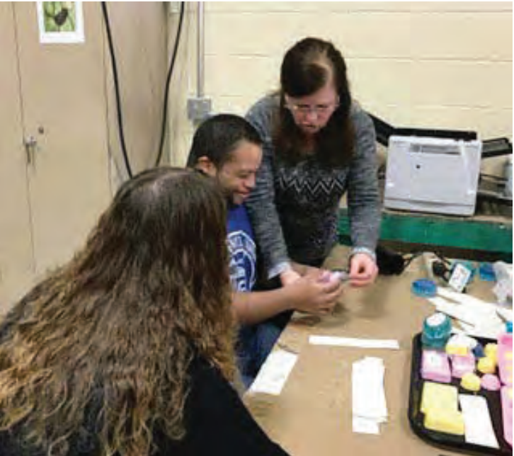
A class member is getting the buddy experience at Hope Enterprises which gives them the opportunity to participate with a buddy and learn what their duties are.