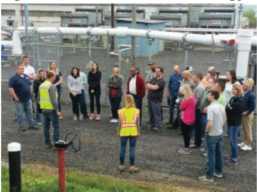
(l) The Class of 2018 learns more about the landfill and the co-gen plant.