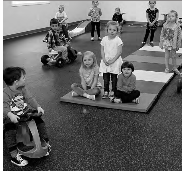
Children enjoy the indoor play area at the FUN Academy Child Care Center in Muncy.

“The building is a little bit unique in that we didn’t move into an