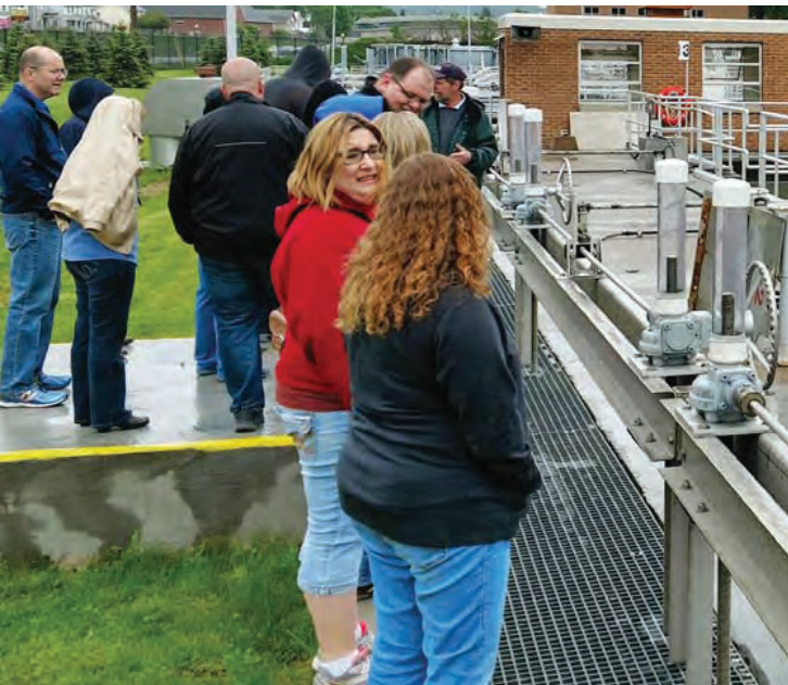
Standing in the drizzling rain and learning so much about wastewater treatment, brings it all together for the environment and energy.