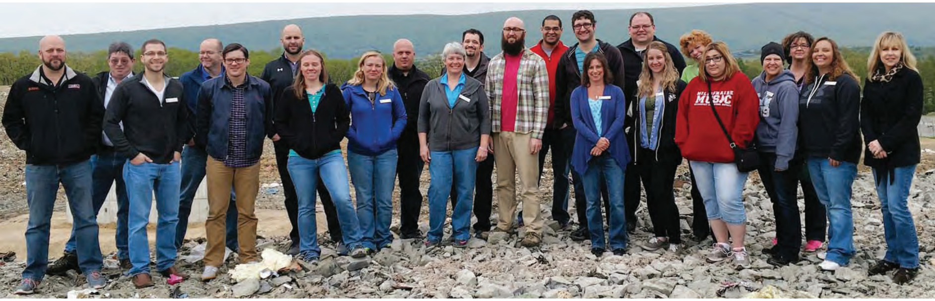
Leadership Lycoming Class of 2017 standing on top of the world...ah, landfill.