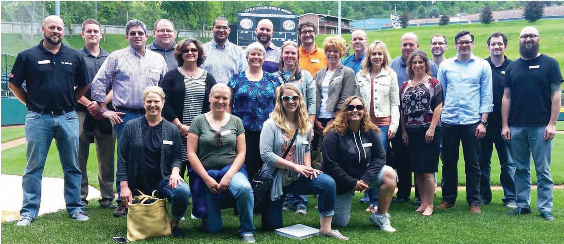
The Leadership Lycoming Class of 2017 feeling rather happy to actually have gotten a chance to step onto the field where the Little League games are played.