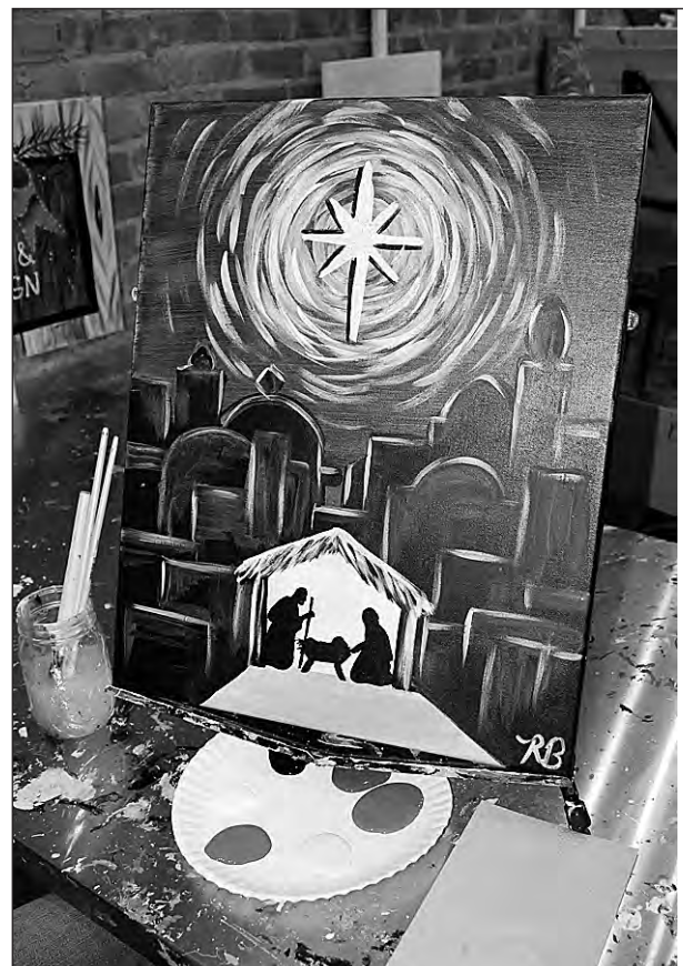
A finished painting dries after being worked on at Wine and Design, 357 Market St.

For more information about how to attend, email williamsport@wineanddesign.com or call 570-846-0993.