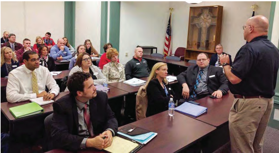
It was great to have the opportunity to tour the 9-1-1 Call Center and the Department of Public Safety. We learned survival tips to use in emergencies and to see the process of emergency calls and the technology used to handle them.