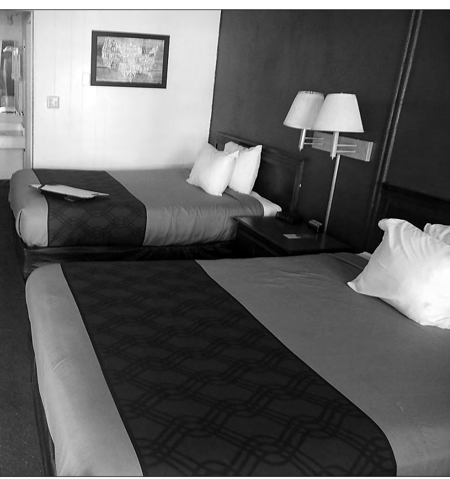
Rooms at the Econo Lodge are furnished to provide customers with comfortable stays. The motel is located at 2019 E. Third St.,

Bill Zuber, assistant general manager, Econo Lodge, stands before the sign overlooking the busy Golden Strip. The motel is located near many restaurants and commercial establishments.