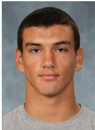
Coleman Good Muncy High School